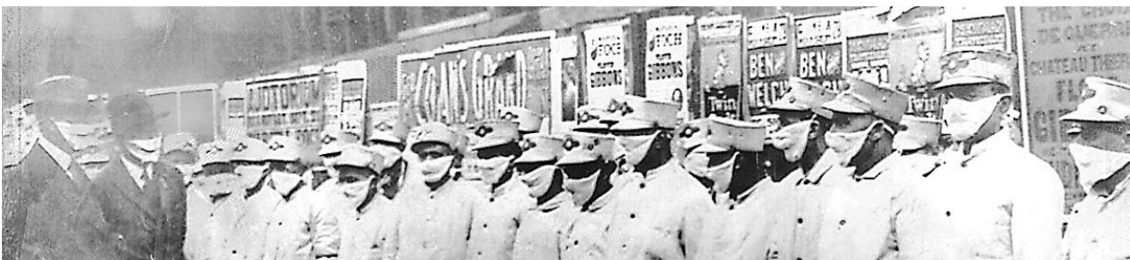
Photo of masked sanitation workers in Chicago during the 1918 Spanish Flu Pandemic