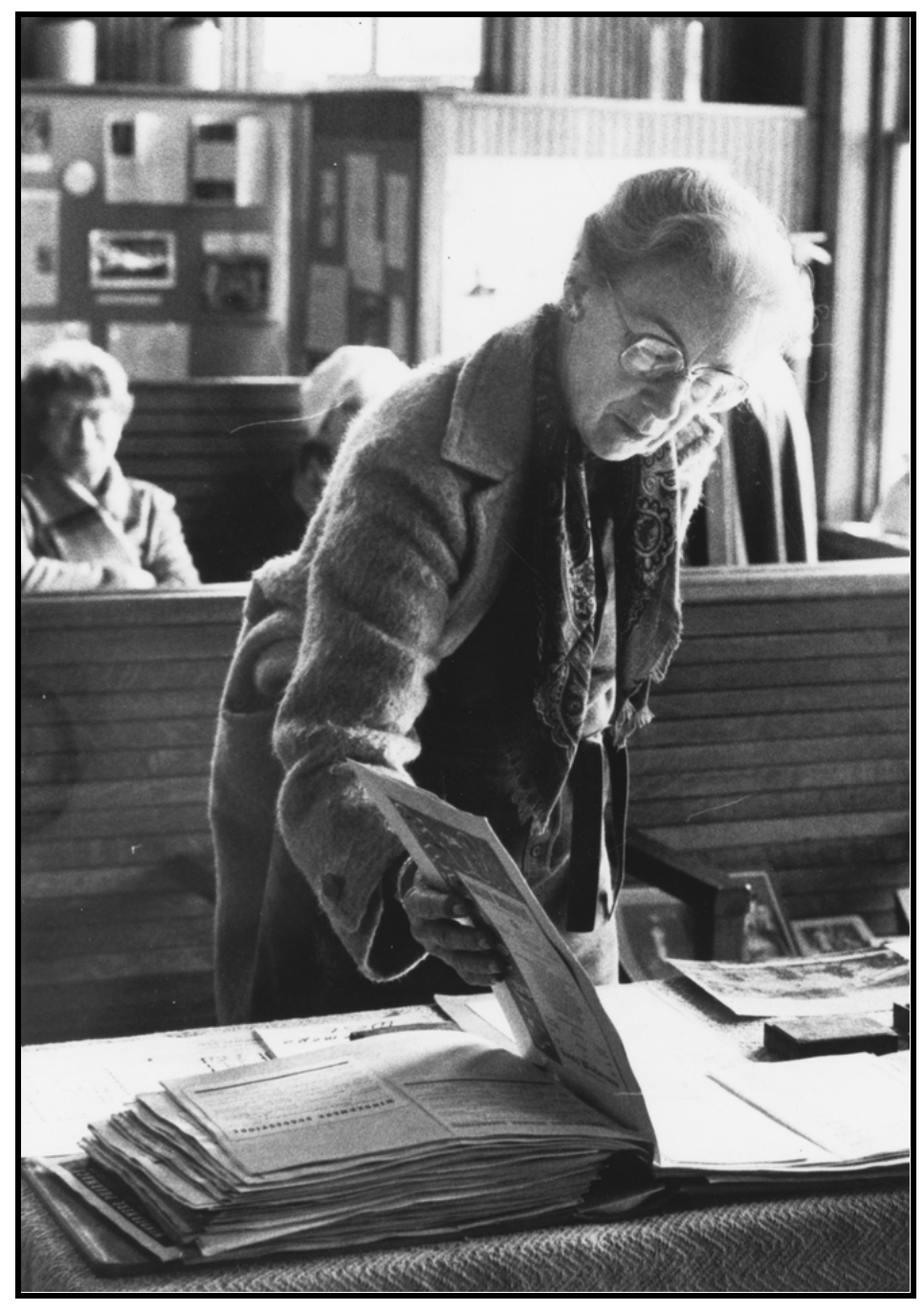
"Hyde Park Neighborhood"