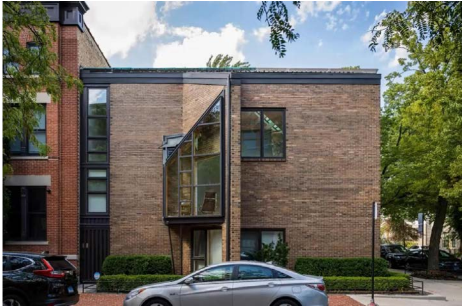
Walter Netsch and Dawn Clark Netsch House, 1972, 1700 N. Hudson Avenue.