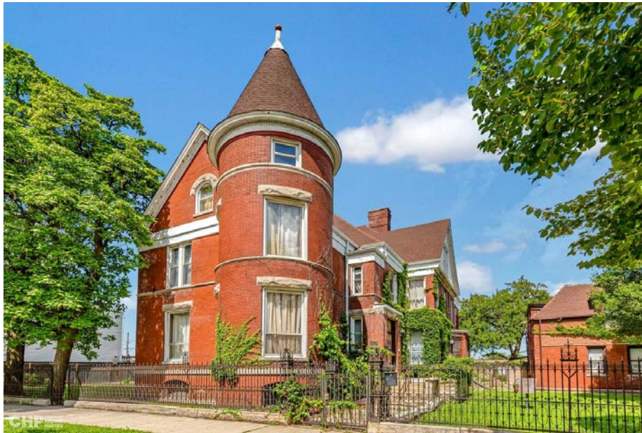
Florence Crittenton Anchorage / The Wolfson Building, 1888, William Longhurst, 2678 W. Washington Blvd, East Garfield Park.

West Side Women's Shelter Building Named A Chicago Landmark, Saving It From Wrecking Ball; Garfield Park's Wolfson Building was once a safe haven for single women and mothers, particularly women of color. Advocates fought to preserve its history, Trey Arline, Block Club Chicago, 12/13/23