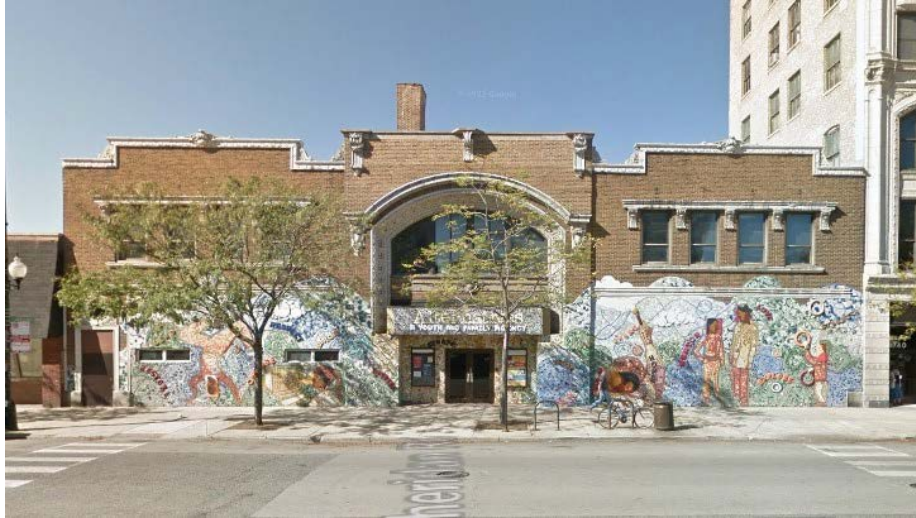
Existing condition of Lakeside Theater building at 4730 N. Sheridan Road with mural.

CircEsteem's Uptown Headquarters Gets $5 Million For Renovation With City Council Approval The circus arts nonprofit plans to renovate its Sheridan Road building into a performing arts center. The project required the removal of a popular mural, Joe Ward, Block Club Chicago, 4/19/23