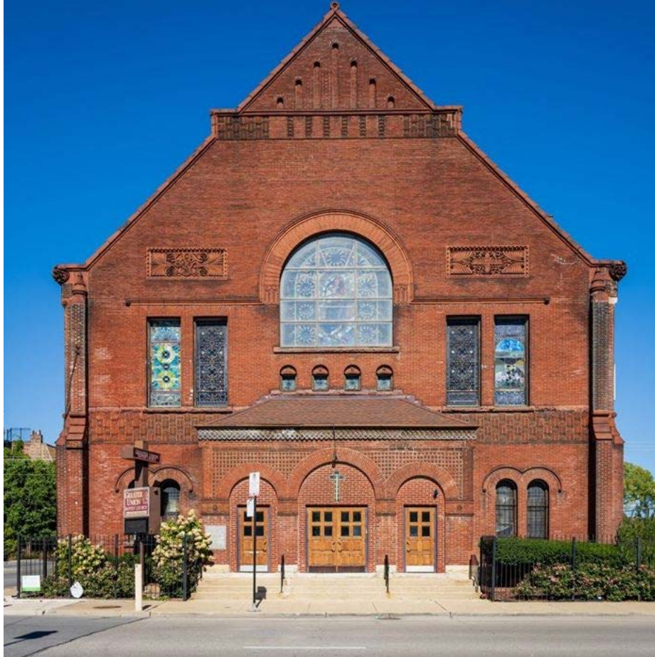
Greater Union Baptist Church, 1888, William Le Baron Jenney, 1956 W. Warren Blvd.