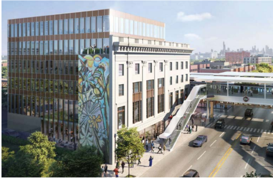
Rendering of proposed facade preservation adaptive reuse plan for Washington Park National Bank at 6300 S Cottage Grove Avenue. Rendering Credit: bKL Architecture / DL3 Realty

Historic Washington Park National Bank Building Gets Approval To Build Luxury Offices; The $40 million redevelopment project, a collaboration between two Black-owned firms, could be completed by 2025, Jamie Nesbitt Golden, Block Club Chicago, 9/14/23