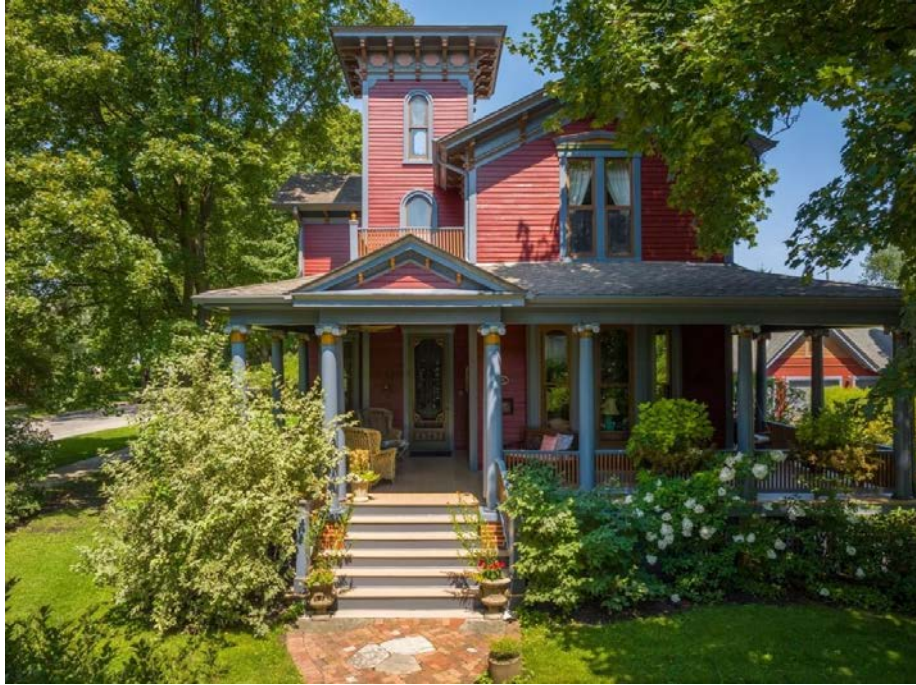
Phoebe and John Gray House, c.1850s, 4362 W. Grace