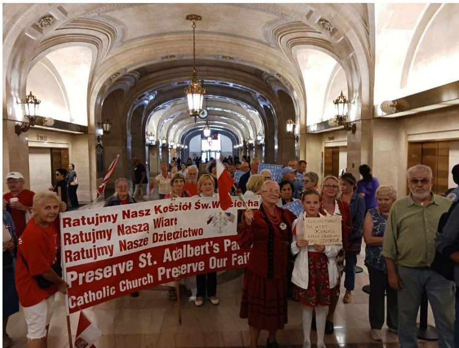
Supporters of landmarking the shuttered St. Adalbert's church during a special meeting of the Commission on Chicago Landmarks Aug. 7, 2023. St. Adalbert Church, Henry J. Schlacks, 1636 W. 17th Street.