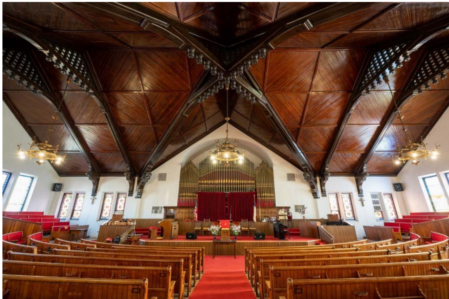
Wood-beamed ceiling and organ at Greater Union Baptist Church, 1888, William Le Baron Jenney, 1956 W. Warren Blvd.