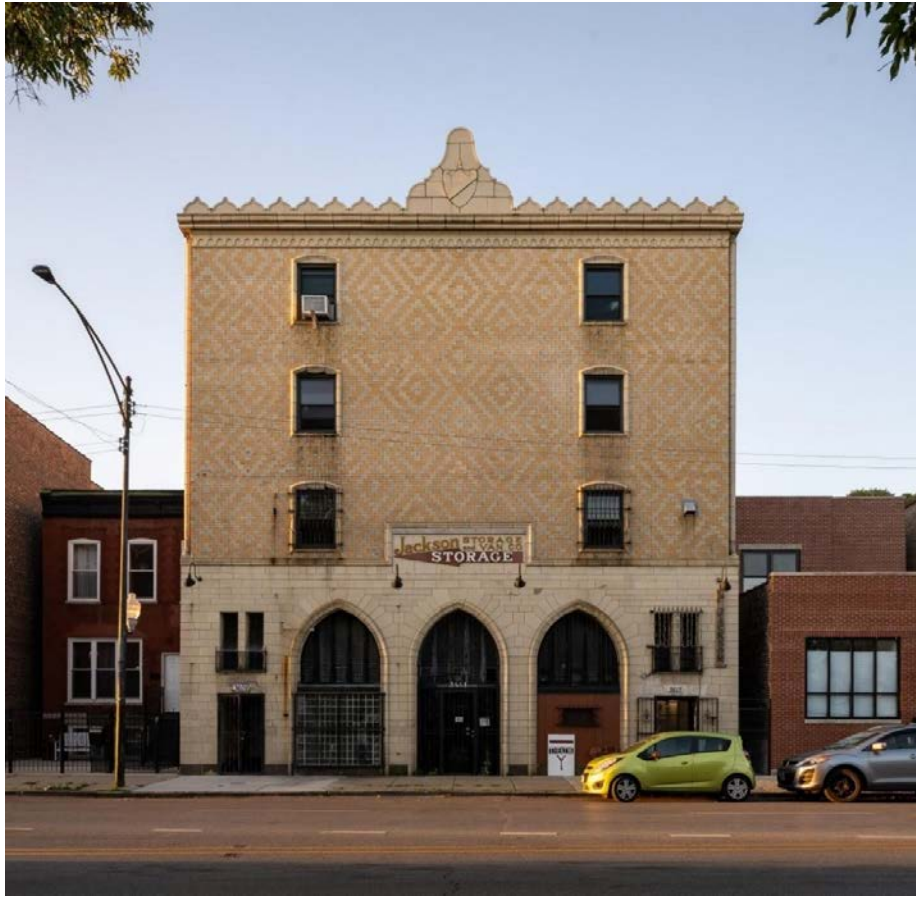
Jackson Storage and Van Company Warehouse, 1927, Hall, Bisbee & Rhenisch, 3609-3611 W. Cermak Road.