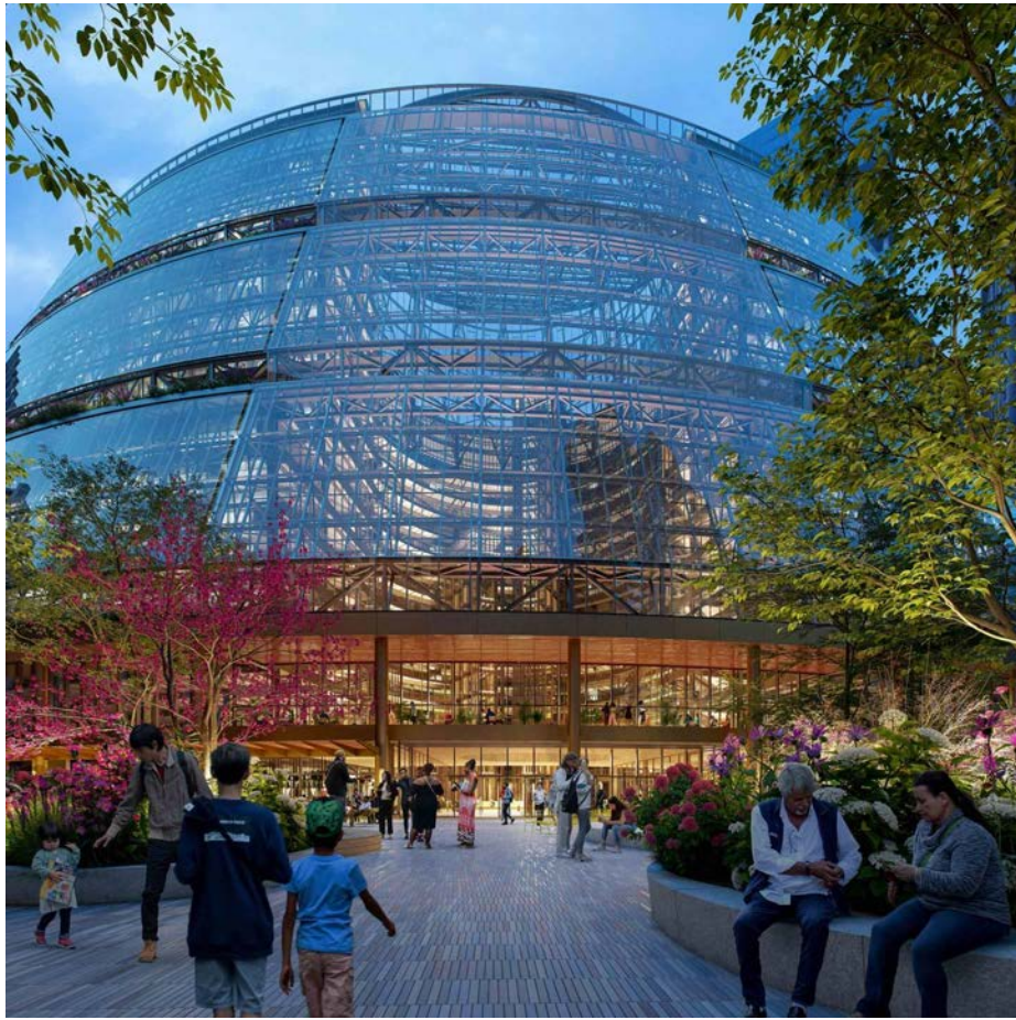
Rendering of James R. Thompson Center Reuse, 1985, Helmut Jahn, 100 W. Randolph Street.