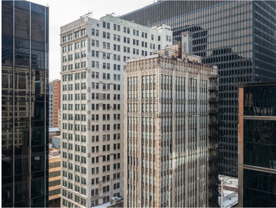
The Century and Consumers Buildings. The Century Building, 1915, Holabird & Roche, 202 S. State Street. The Consumers Building, 1913, Jenney, Mundie & Jensen, 220 S. State Street.