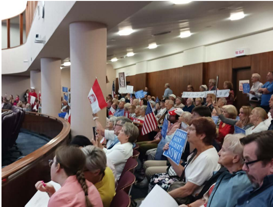
Supporters of landmarking the shuttered St. Adalbert's church during a special meeting of the Commission on Chicago Landmarks Aug. 7, 2023. St. Adalbert Church, Henry J. Schlacks, 1636 W. 17th Street.