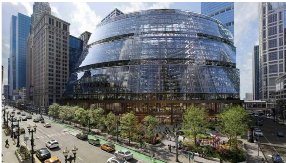
Rendering of James R. Thompson Center Reuse, 1985, Helmut Jahn, 100 W. Randolph Street.