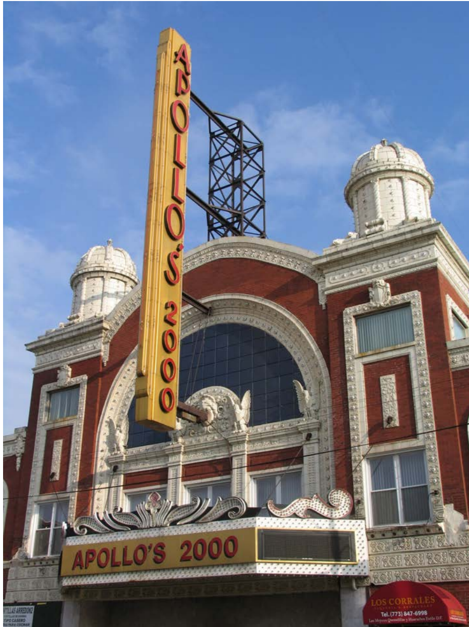
Apollo's 2000 / Marshall Square Theater, 1917 by Alexander Levy with 1936 remodel by Roy B. Blass, 2875 W. Cermak Road.

Apollo's 2000 Theater In Little Village Gets First Approval To Become A Chicago Landmark; The family who owns the theater said they hope a landmark designation could bring in funds to help maintain the historical building, Madison Savedra, Block Club Chicago, 12/7/23