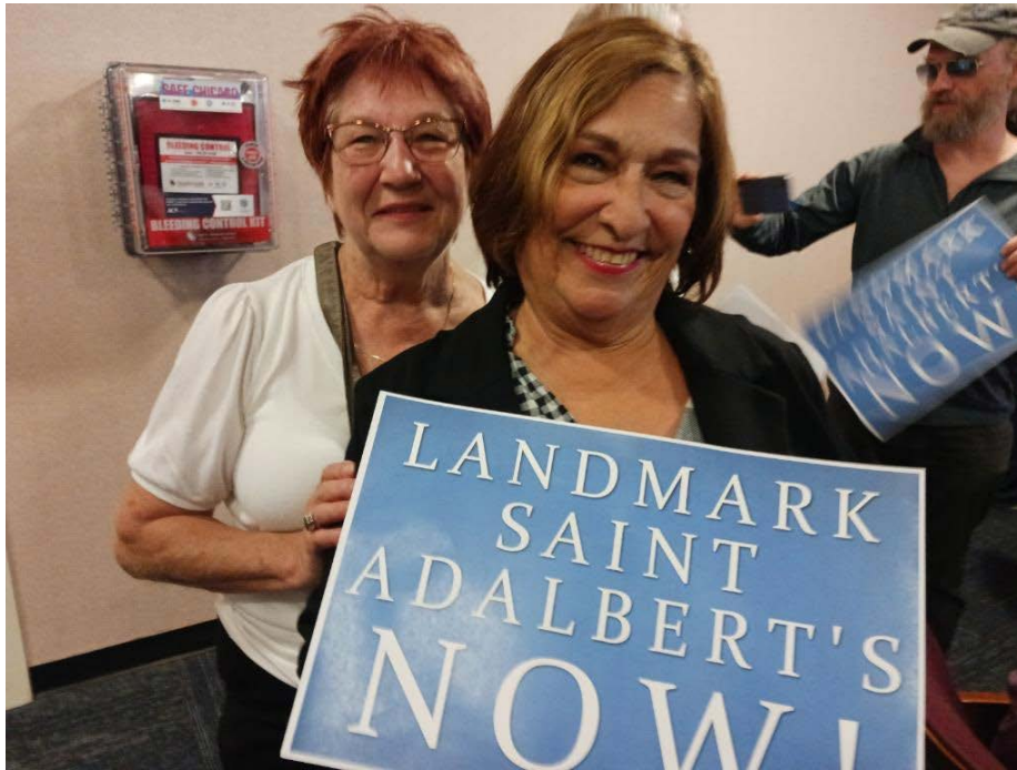
Supporters of landmarking the shuttered St. Adalbert's church during a special meeting of the Commission on Chicago Landmarks Aug. 7, 2023. St. Adalbert Church, Henry J. Schlacks, 1636 W. 17th Street.

Pilsen's St. Adalbert Church Gets Latest Landmark Approval; The Pilsen church has been the site of ongoing protests since it was closed in 2019, as former parishioners fear it will be redeveloped. The City Council must still approve the landmark designation, Quinn Myers, Block Club Chicago, 9/7/23