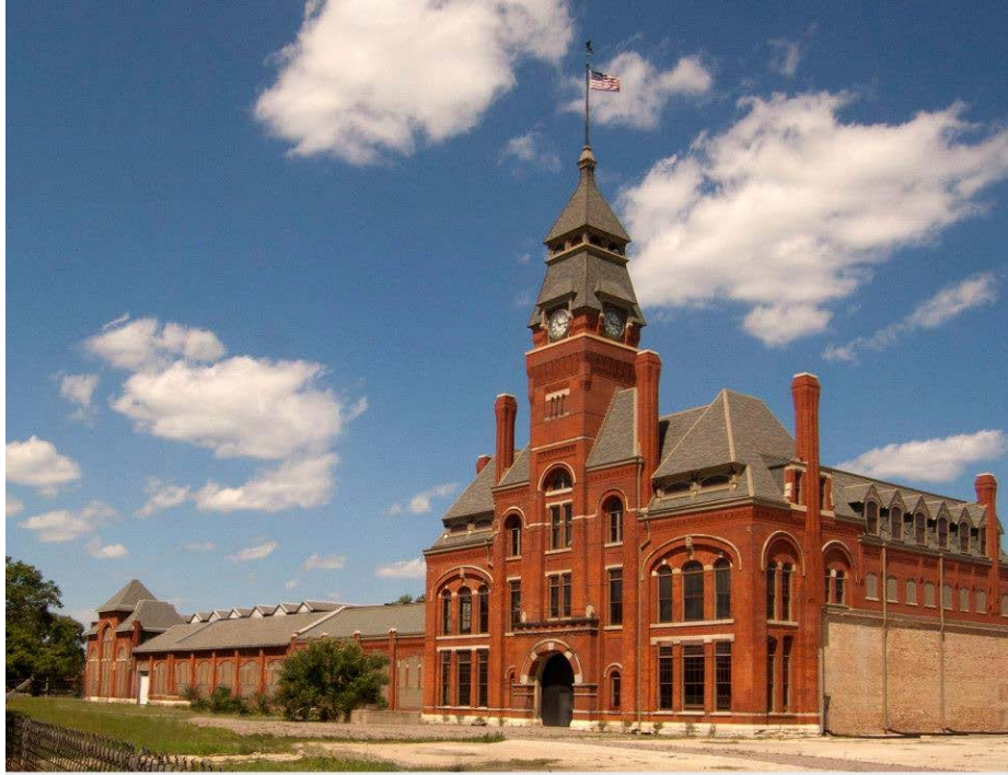
The Restored Pullman Clock Tower and Administration Building, 1880, Solon S. Beman, 11057 S. Cottage Grove Avenue.

Pullman National Monument Upgraded to National Historical Park — and the Name Change Makes a Big Difference, Patty Wetli, WTTW Chicago, 1/19/23