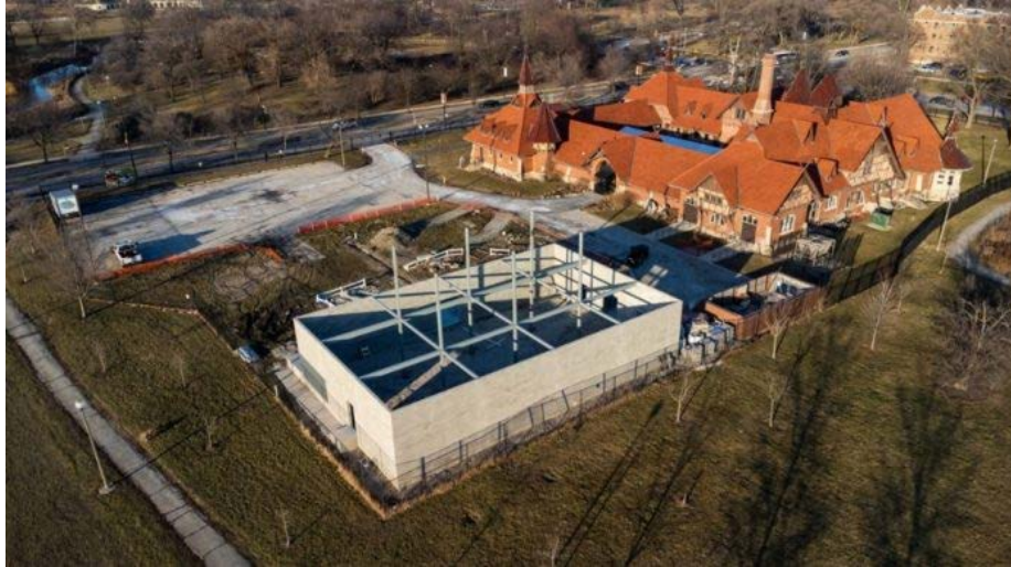
Photo with unpermitted concrete block building under construction in foreground. Humboldt Park Receptory Building and Stable, 1896, Frommann & Jepsen, 3015 W. Division Street.

Illegal Building in Humboldt Park Will Be Demolished, Museum Leader Apologizes for 'Missteps' Patty Wetli, WTTW Chicago, 10/4/23