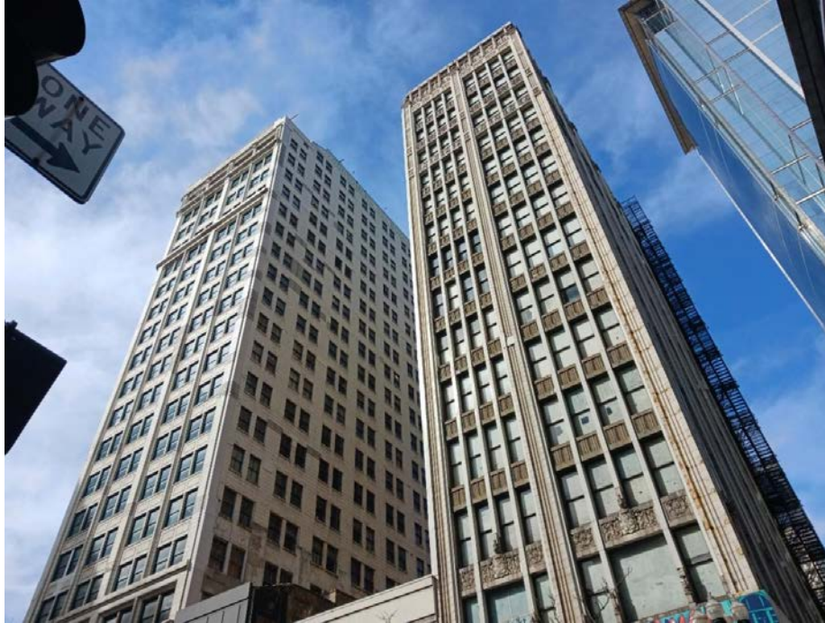
The Century and Consumers Buildings. The Century Building, 1915, Holabird & Roche, 202 S. State Street. The Consumers Building, 1913, Jenney, Mundie & Jensen, 220 S. State Street.

City panel backs landmarks label for two State Street buildings; The federally owned towers date from the early 20th century and could still be torn down, but the decision of the Commission on Chicago Landmarks could increase pressure to preserve them; David Roeder, Chicago Sun-Times, 12/7/23