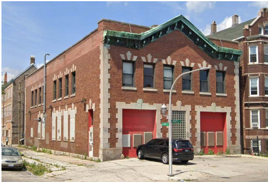
Little Village Chicago Fire Station, 2358 S. Whipple Street.

Historic Little Village Fire Station on the Path to Receiving Landmark Status, Becoming Community Hub, Emily Soto, WTTW Chicago, 10/19/23