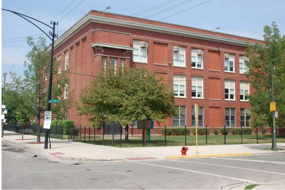
Aspire Center / former Emmet Elementary School, 5500 W. Madison Ave.