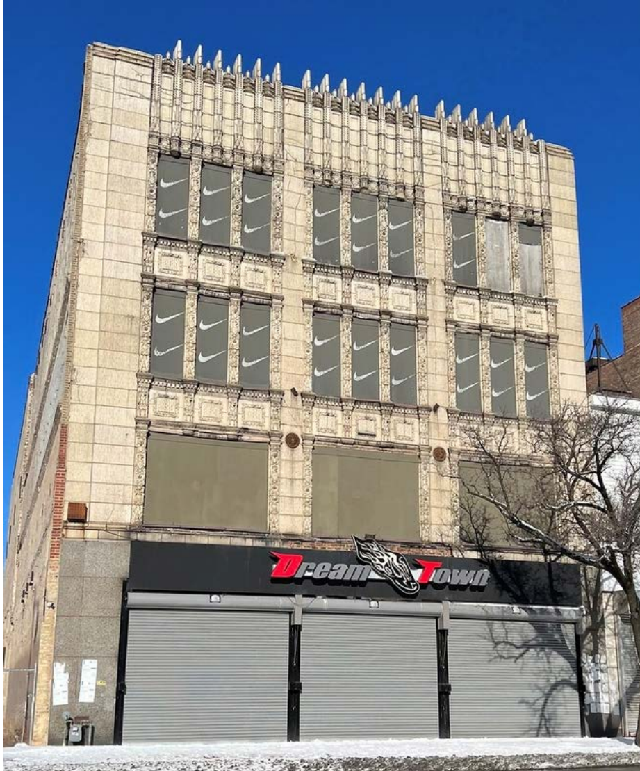
4042 W. Madison.