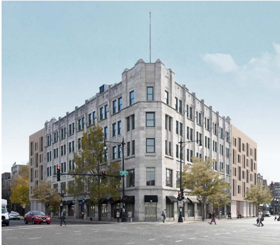
Lincoln Trust & Savings Bank / 5/3 Bank, 1926, Lawrence & Co., 3959 N. Lincoln Ave.