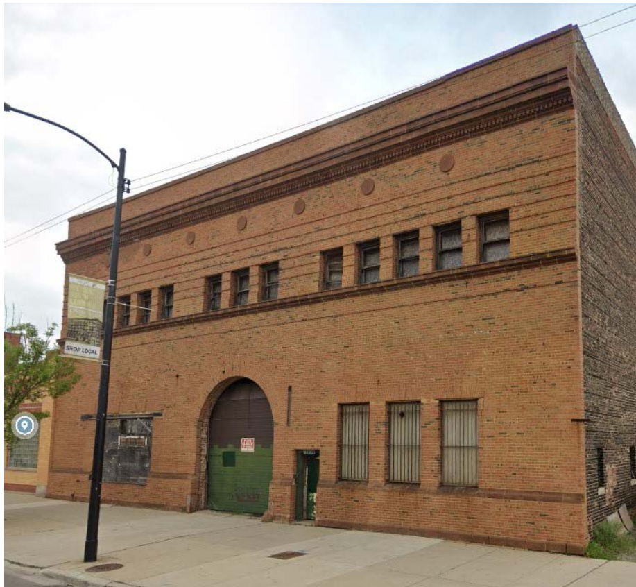
Marshall Field & Company Warehouse Stable, 1904, William Ernest Walker, 4343 S. Cottage Grove Avenue.

Bronzeville's Palmer Mansion Will Become Obsidian Collection Archive, Coworking For Black Creators; City Council also approved $6 million for the construction of the much-anticipated Lillian Marcie Center for the Performing Arts, Jamie Nesbitt Golden, Block Club Chicago, 4/19/23