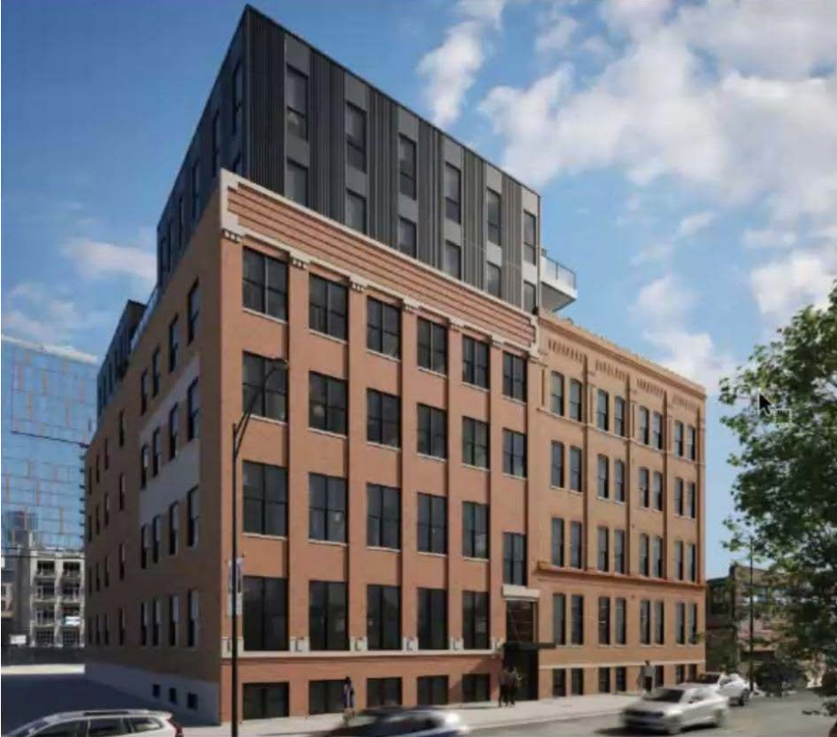
A proposed addition to 159-167 N. Racine Ave. would bring additional apartments to the West Loop. Rendering credit: Space Architects + Planners

Developer plans residential addition at 167 N. Racine; The mixed-use building will get eight new apartments, Lukas Kugler, Urbanize Chicago, 9/12/23