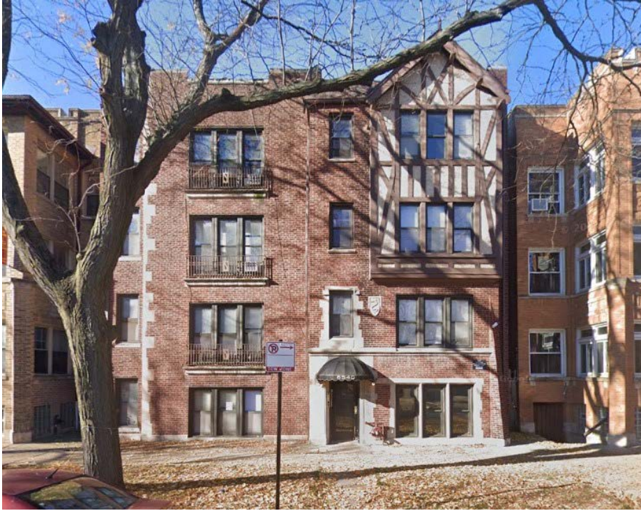
6540 N. Glenwood Avenue Apartment Building before suspected arson.

Rogers Park Building, Damaged In Fire, Could Be Redeveloped With Added Affordable Units; The building was set ablaze by a disgruntled tenant in 2021 and has been vacant since. It could be rehabbed as market-rate apartments with five affordable units added, Charles Thrush, Block Club Chicago, 12/20/23